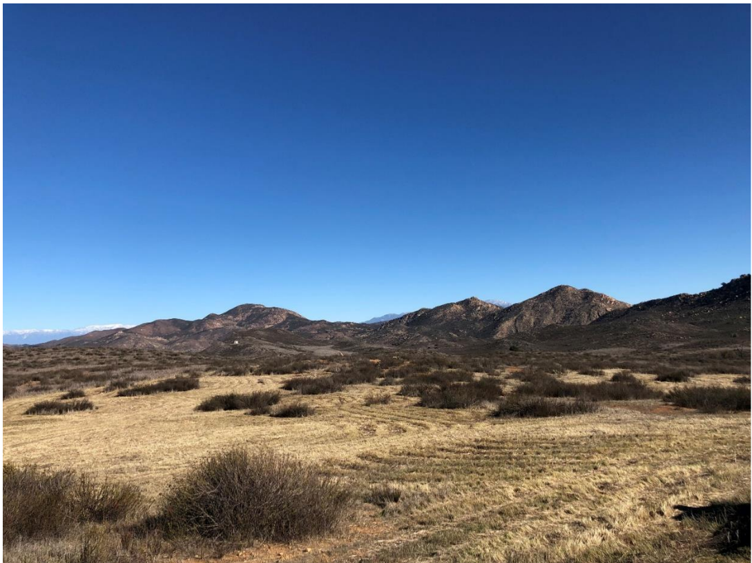
Figure 3. Quino checkerspot butterfly Expansion Unit

As specified in the SWRCMSR Management Plan, a management goal of the Reserve is to expand habitat for Quino checkerspot butterfly ( Euphydryas editha quino ). Reserve management selected a 2-acre plot that had an abundance of host plant Plantago erecta and is adjacent to an active management site. Field staff implemented IPM techniques by mowing and utilizing selective herbicide in order to reduce non-native grasses in the unit.