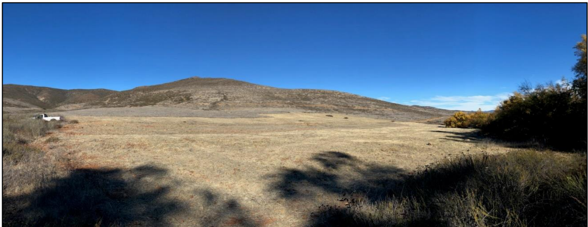
Figure 1. Munz's Onion management site-North Shore

A significant increase in rainfall provided an ideal environment for native plant species. Numerous observations of covered species such as Munz's onion ( Allium munzii ), Palmer's grapplinghook ( Harpagonella palmeri ), and Paysons jewelflower ( Caulanthus simulans ) were seen by Reserve Management and Western Riverside County Regional Conservation Authority (RCA) Biological Monitoring Program Crew. Identified sites were plotted and will be managed for non-native plant species in subsequent years.