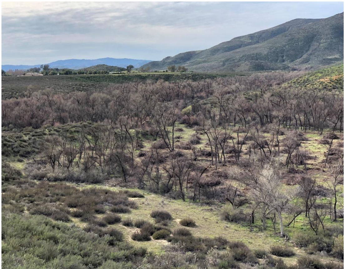
Figure 2. Tualota Creek tamarisk removal

Reserve staff and Cal-Fire crews cleared 3 acres of Tamarisk ( Tamarix ramosissima ) in Tualota Creek. In order to continue restoring the creek, a 2-phase nursery that is capable of holding 500 plants was created. Reserve staff propagated approximately 250 native plants this year, which included various species of Salix, Baccharis, and Populus. These plants were installed in the creek and placed on drip irrigation as part of the active restoration component of the project. Additionally, brown-headed cowbird ( Molothrus ater ) trapping within the watershed was also conducted in order to protect nesting birds from being parasitized. A total of 37 brown-headed cowbirds were successfully captured and euthanized.