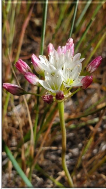
Munz's Onion ( Allium munzii )