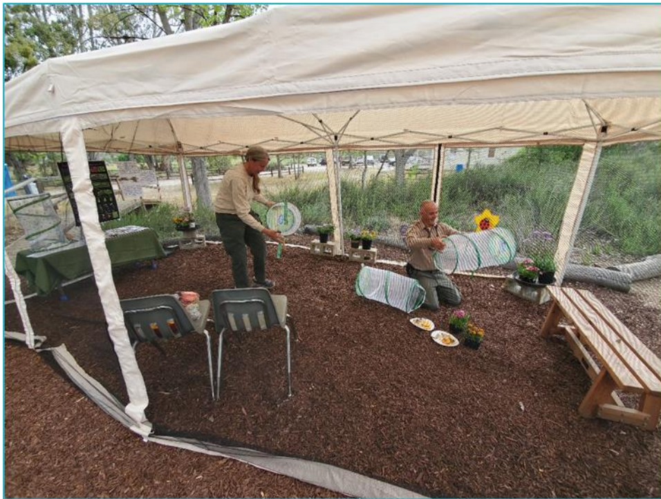
Figure 4. Staff preparing for Alamos Schoolhouse Earth Day special event.

Alamos Schoolhouse has one (1) volunteer dedicated to the Nature Center. The volunteer worked a total of 576 hours and conducted nature hikes, daily interactions, and programs. Additionally, Reserve staff conducted multiple training sessions for Lake Skinner volunteers. The training informed park volunteers on covered species, goals, and upcoming projects. This information can be distributed to visitors entering the regional park.